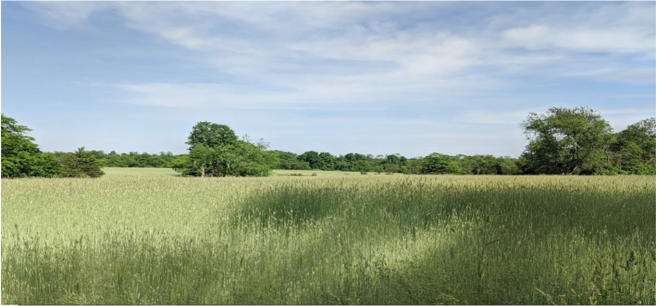
Saums Farm, Rockafellows Mill Road – Preserved by Readington Township in 2020