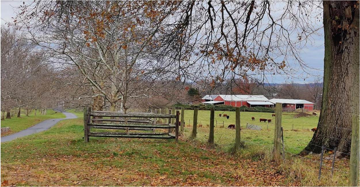
Barrettstown Joy Farm, Lamington Road – Preserved by Readington Township in 2024