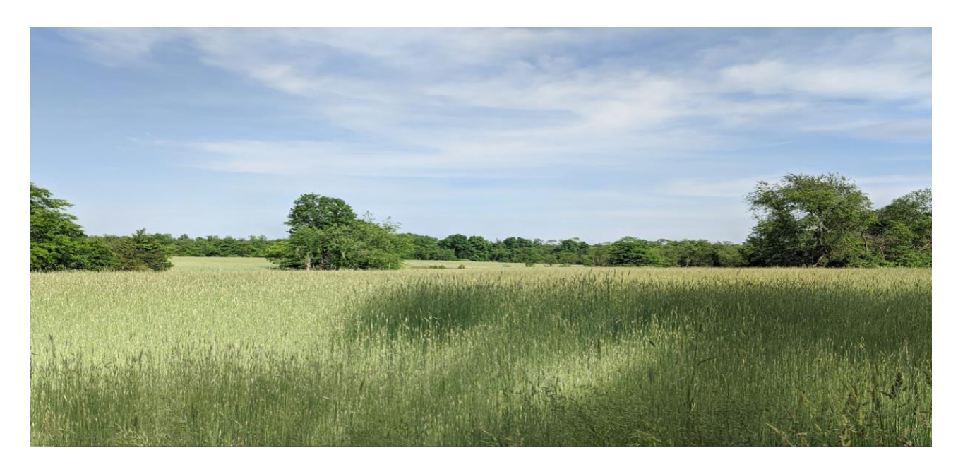
Saums Farm, Rockafellow Mill Road – Preserved by Readington Township in 2020