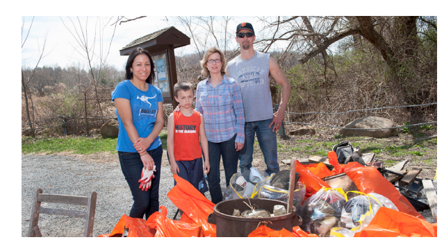
Watch for RHA's Annual Stream Cleanup in April.