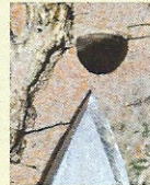
D-shaped exit hole